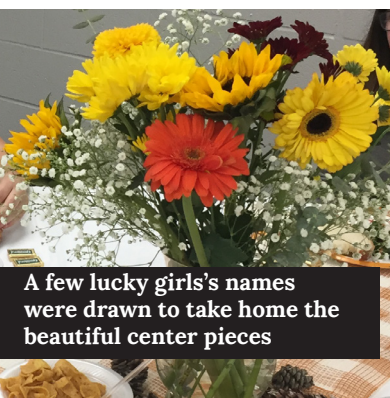
A few lucky girls's names were drawn to take home the beautiful center pieces