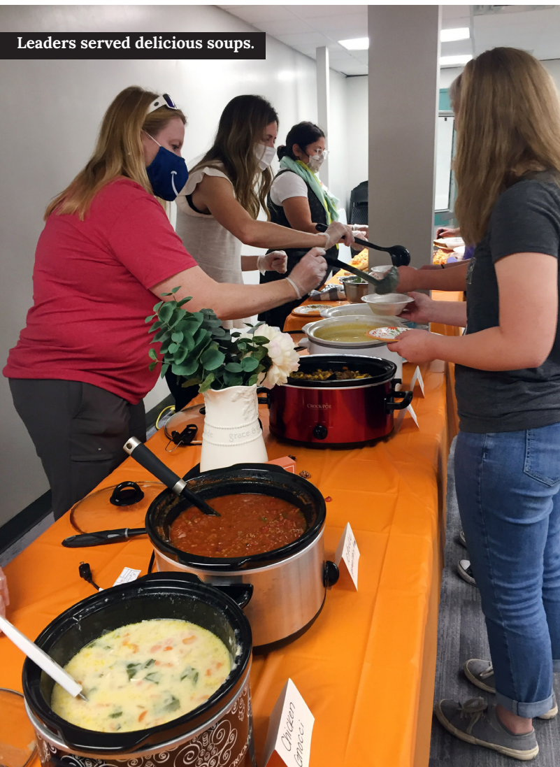
Leaders served delicious soups.