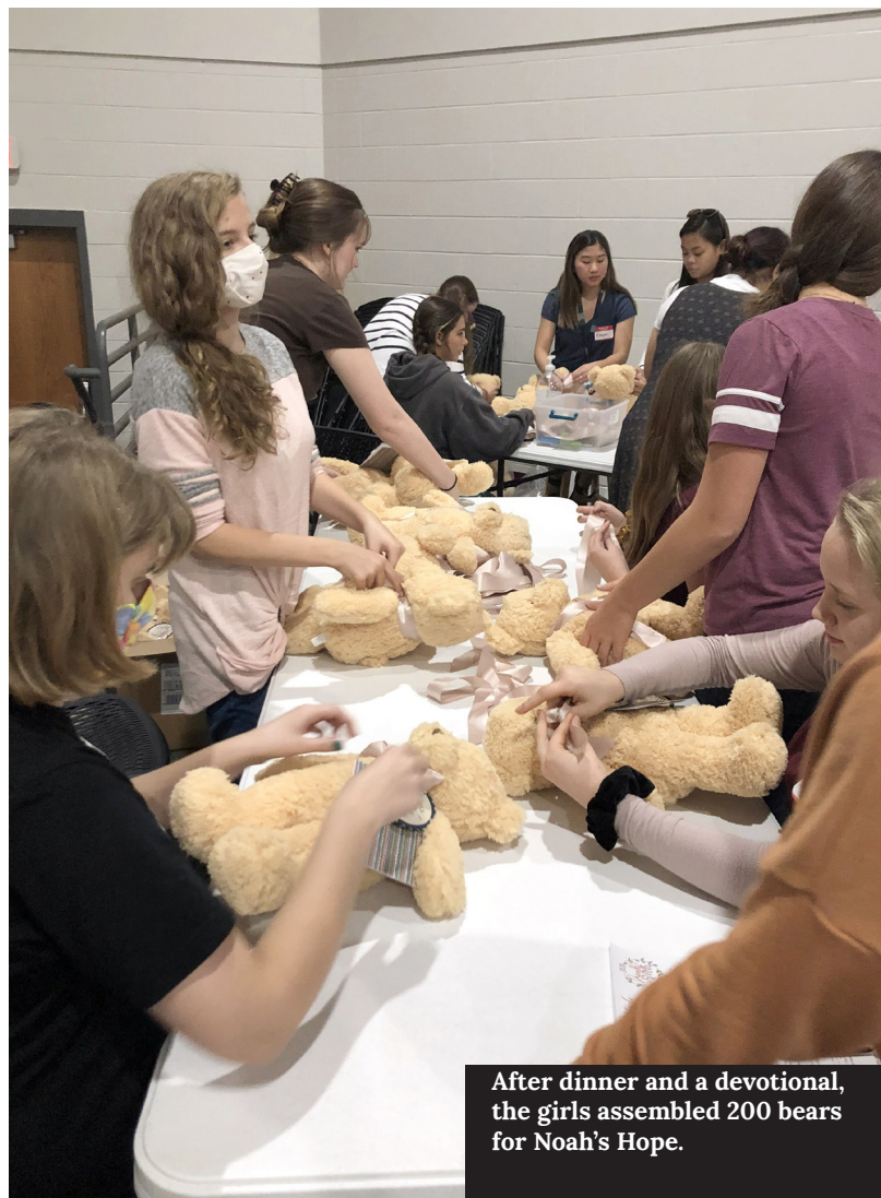
After dinner and a devotional, the girls assembled 200 bears for Noah's Hope.