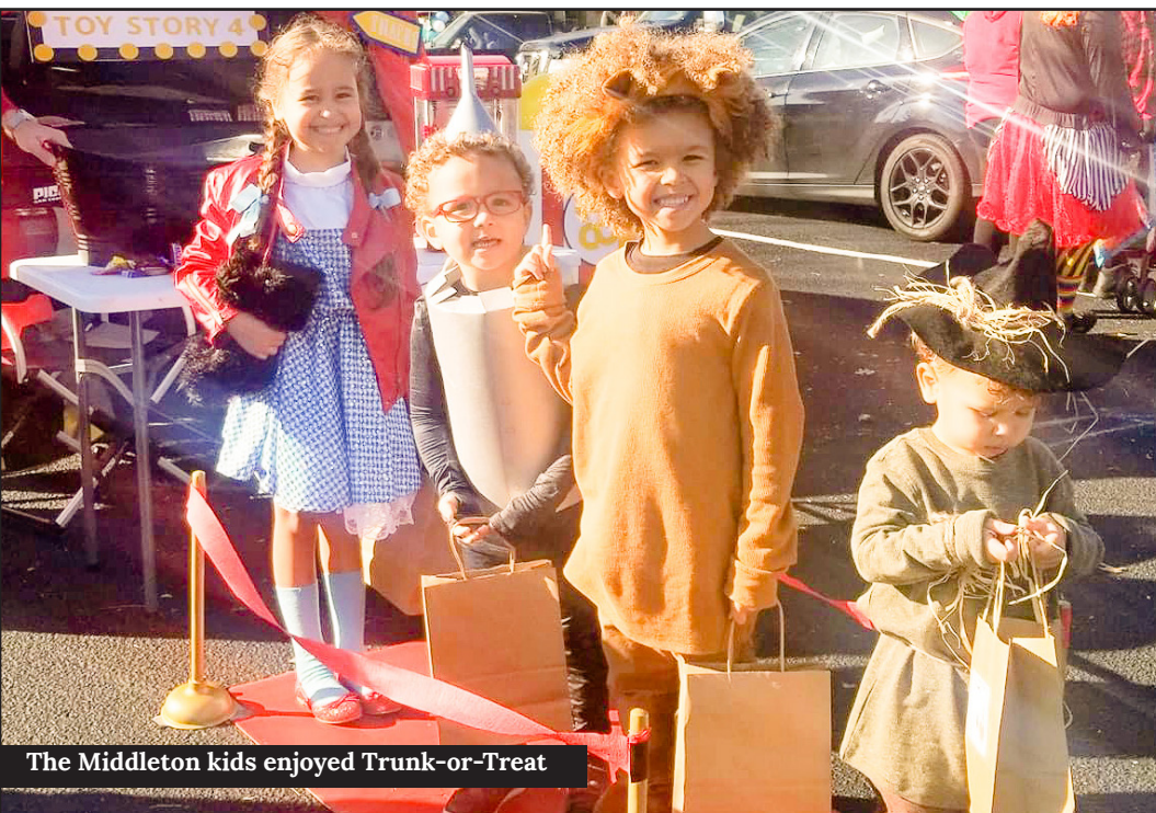
The Middleton kids enjoyed Trunk-or-Treat

His Church is not a building or a physical location. It is a living, breathing, holy temple built with living stones.