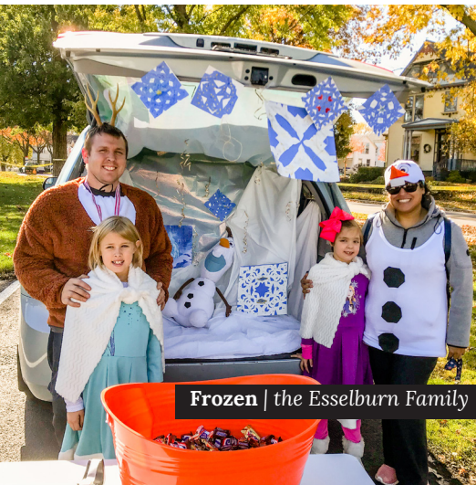
Frozen | the Esselburn Family