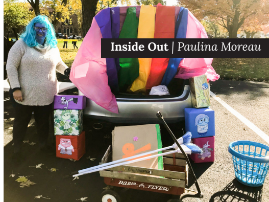
Inside Out | Paulina Moreau