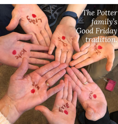
The Potter family's Good Friday tradition.