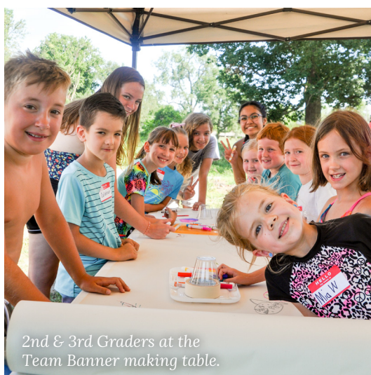
2nd & 3rd Graders at the Team Banner making table.