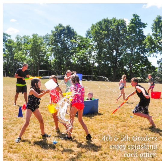
4th & 5th Graders enjoy splashing each other