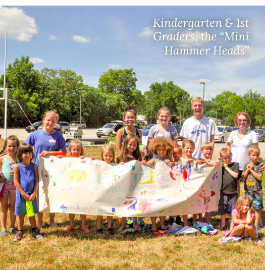
Kindergarten & 1st Graders, the "Mini Hammer Heads"