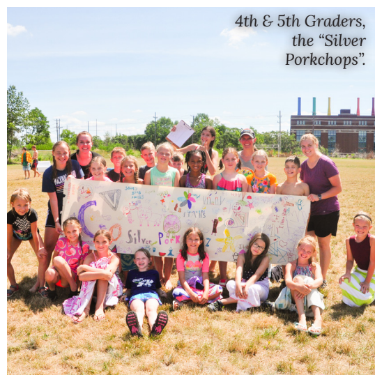
4th & 5th Graders, the "Silver Porkchops".