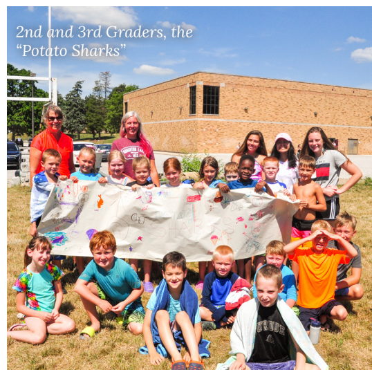
2nd and 3rd Graders, the "Potato Sharks"