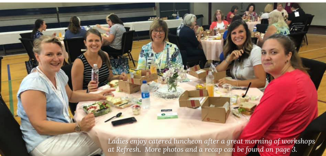
Ladies enjoy catered luncheon after a great morning of workshops at Refresh. More photos and a recap can be found on page 3.

His Church is not a building or a physical location. It is a living, breathing, holy temple built with living stones.