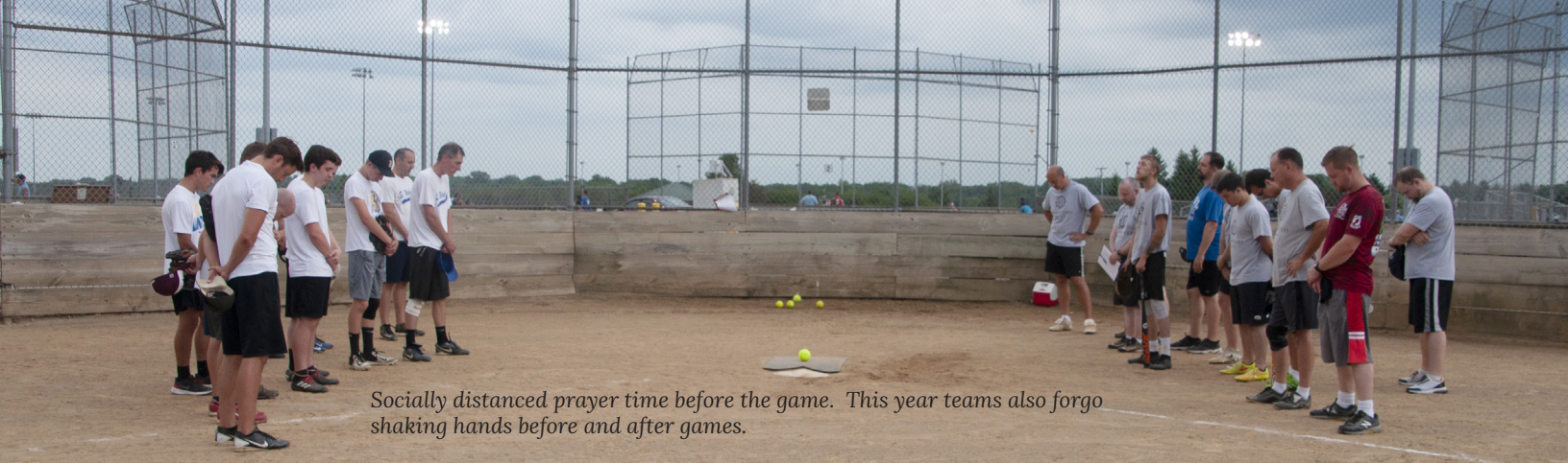
Socially distanced prayer time before the game. This year teams also forgo shaking hands before and after games.