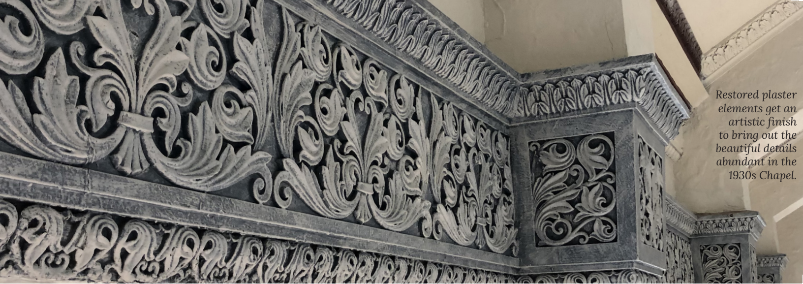
Restored plaster elements get an artistic finish to bring out the beautiful details abundant in the 1930s Chapel.